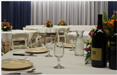
The tables are set for a terrific time.

New Hope Bowl has been family owned and operated for over 50 years. Throughout that time we have been committed to providing you with excellent service in a pleasant setting. We now invite you to see what we have to offer as you prepare for one of life's most important family celebrations.